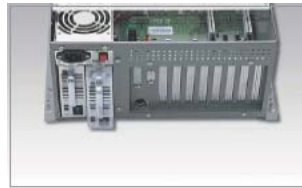
Redundant Power Supply Option