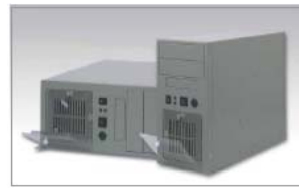
Can be mounted in Different styles