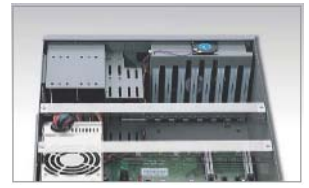
Dual card retainers