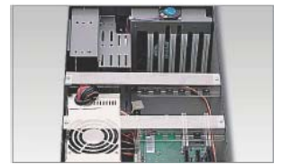
Dual card retainers