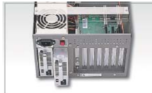
Redundant Power Supply Option