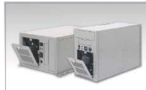
Can be mounted in Different styles