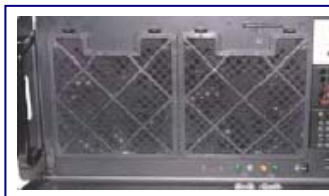
The washable fan filter can be easily taken off to make an easier maintenance.