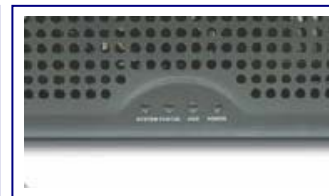
LED indicators include power, HDD, Fan fail and LAN functions.