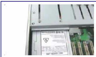
Flexible design to install power bracket can adapt to PS/2 type mini redundant power supply.