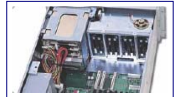
SE4296 reserves the largest space for the full-sized SBC to support up to 12 cards.