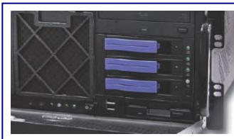
SE4296 enhances the drive bracket to integrate up to three 5.25" and one 3.5" disk drives within a limited space. (extra two 3.5" HDD drives for SE4296-MX).