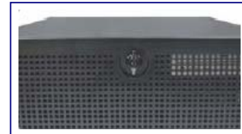
The thumb lock offers the easy operation. Users can choose to lock it or not.