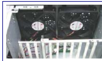
Equipped with two 12cm dual ball bearing fans, AREMO-4196 provides the best ventilation up to 208CFM to expire heat from the system.