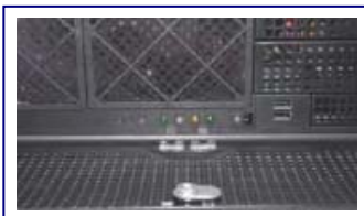
SE-4296 is equipped with two USB 2.0 connectors on the front panel to have a better security control.