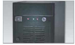
Easy to use Control Panel