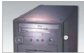
Optional Configuration with LP Drive 300