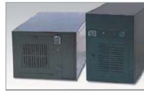
Can be mounted in different styles